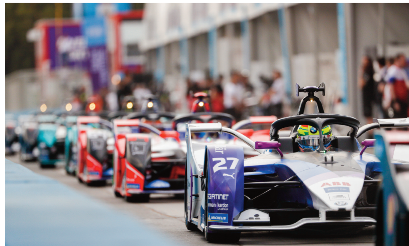
Designing for Formula E makes the learning curve steep and rapid

transfers such as this. Other limiting factors to the charging speed include the current capacity of the charger and cable, the impedance of the battery, and battery balancing.