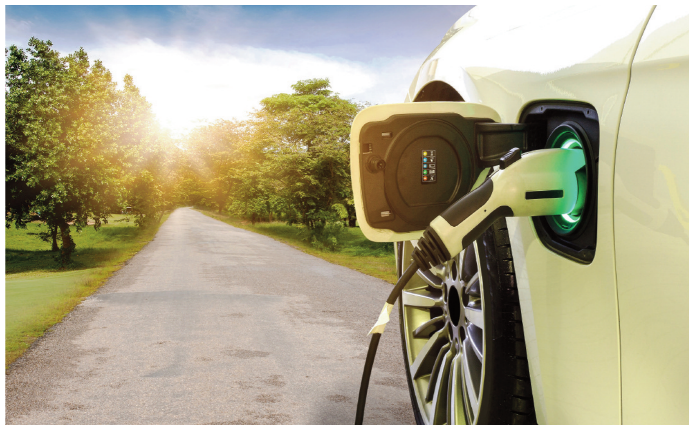
Range anxiety: How far will the car go on one charge?

Most electrical grids are not designed for massive power