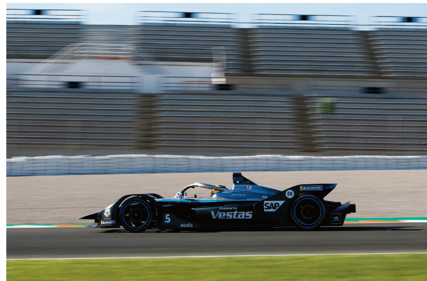
Formula E is pushing boundaries for EV design

then design better performing, higher efficiency and more reliable components for use throughout the powertrain.